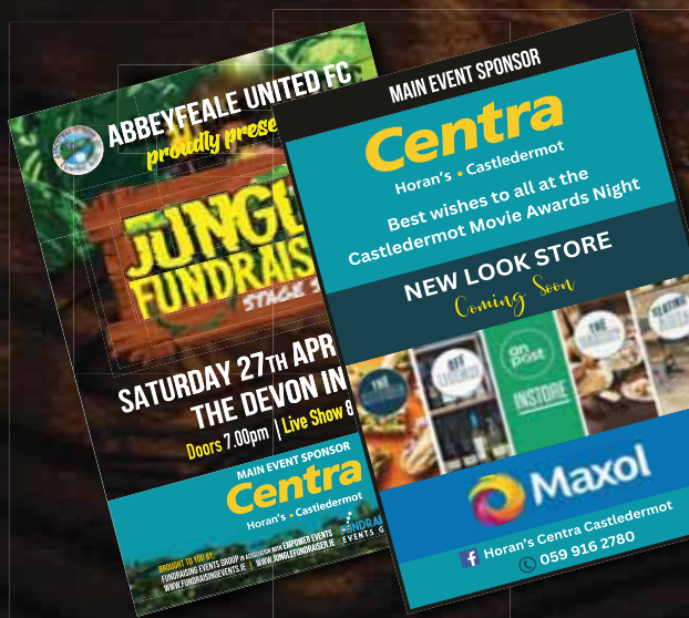
EVENT BOOK, SIGNS, POSTERS & ADVERTS