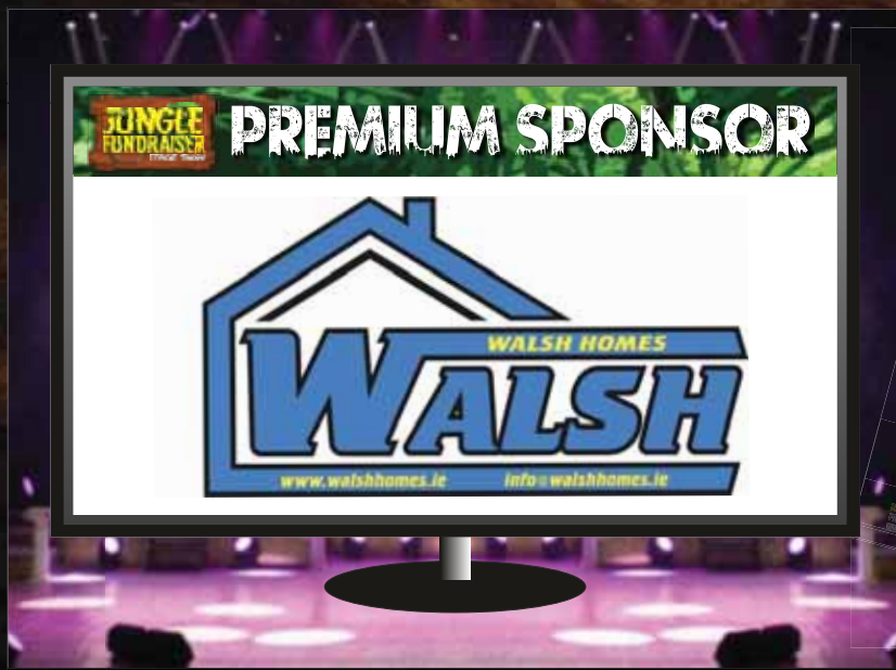
LARGE SCREEN VENUE GRAPHICS