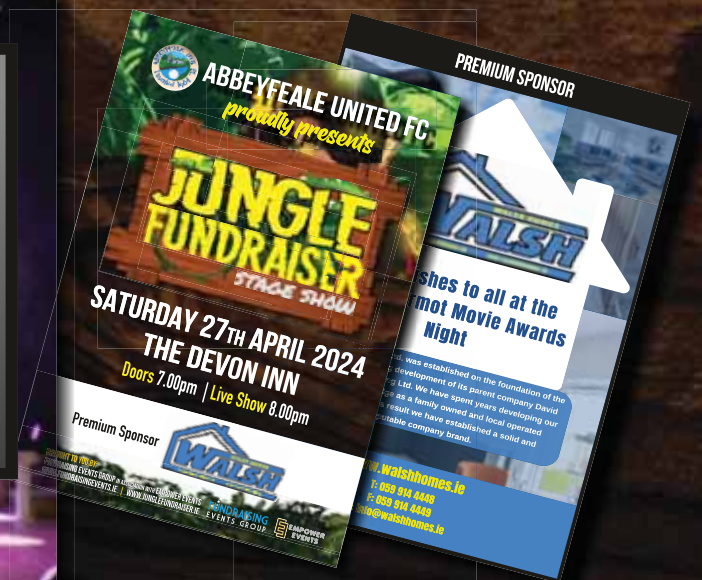
EVENT BOOK, SIGNS, POSTERS & ADVERTS