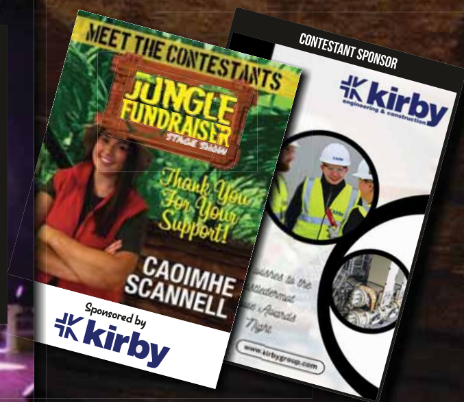
EVENT BOOK, SIGNS, POSTERS & ADVERTS