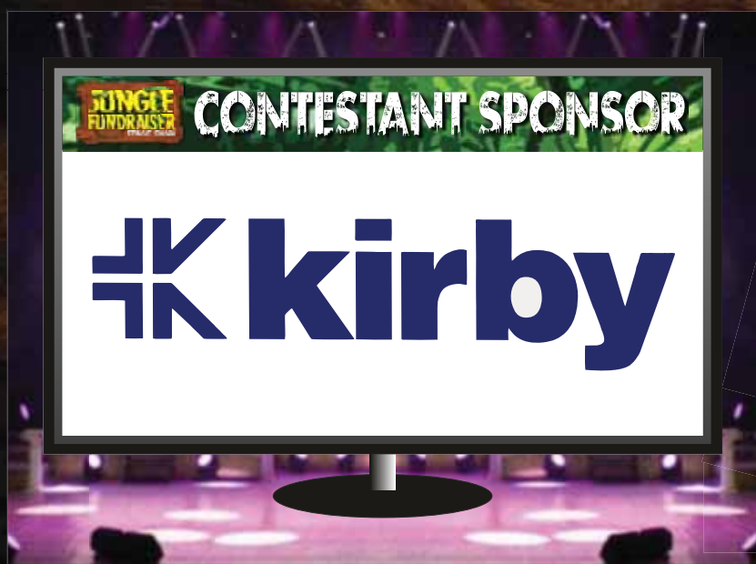
LARGE SCREEN VENUE GRAPHICS