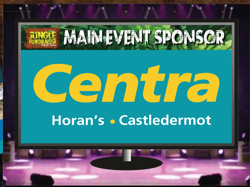
LARGE SCREEN VENUE GRAPHICS